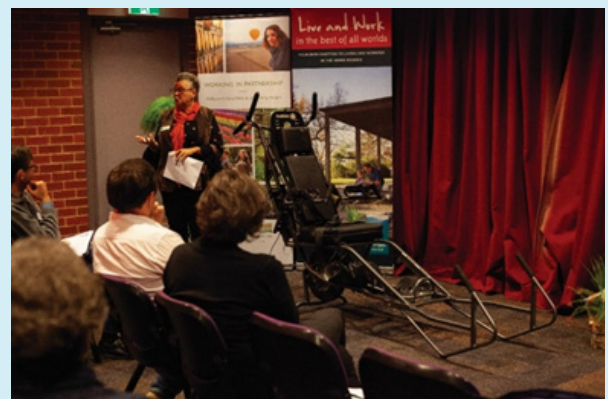
Image description: Woman with dark clothing and red scarf talking to seated audience members. All-terrain wheelchair is displayed at front of room in front of a red stage curtain.