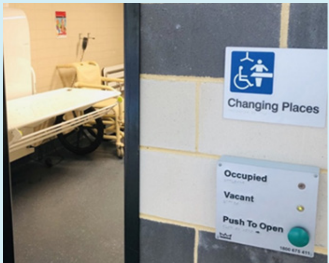
Image description: View into Changing Places facility from open doorway, showing adult sized change table.

The facilities have a shower, accessible toilet, an adult hoist system, Braille signage, colour contrast and tactile indicators.