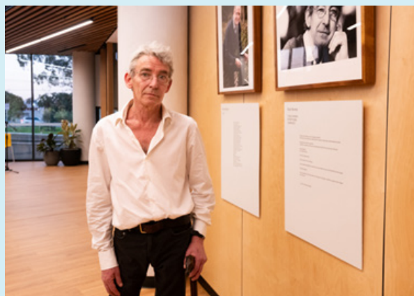
Image description: Man in white shirt and black trousers holding a walking stick, standing in front of artwork at the launch of Poetic Portraits.

The application process prioritised accessibility, considering factors like colour contrast and text size to enhance readability, poems were placed at the bottom of images. They address concerns about height. The printed anthology is for sale at the Yarra Ranges Regional Museum.