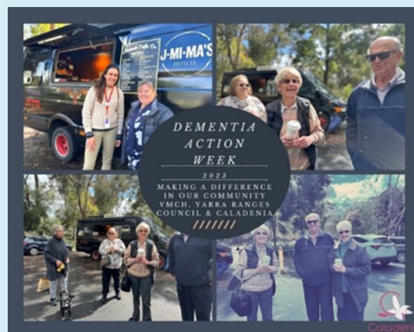
Image description: Flyer for Dementia Action Week. Four pictures of community members near a coffee van, and text in centre of images.

Over the next four years, the project will focus on educating front-facing staff and volunteers. This will enhance their awareness and skills to help people with dementia. The project actively involves service providers, community members, and those with dementia. It aims to improve information and service access. This will foster a dementia-friendly environment in the Yarra Ranges.