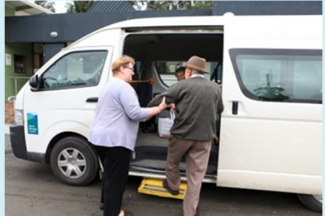
Image description: Woman (left) in light blue shirt and black pants, assisting a man (left) in brown trousers, grey cardigan, and brown hat into a white van.

EV Community Transport provides 1:1 or group transport services. They support people over 65 through My Aged Care and those under 65 through Home And Community Care (HACC) funding. They ran a pilot program in the Upper Yarra region from August 2023 to January 2024. It was supported by the Department of Transport. It connected community members with transport, to those who needed it.