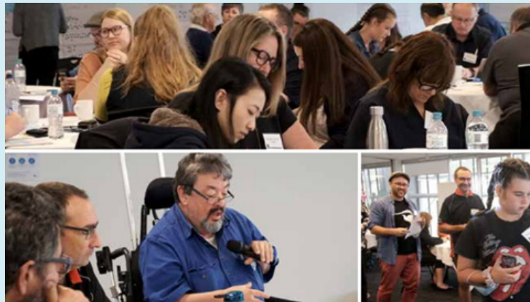
Image description: Page from the Council Plan document with three images of a diverse range of community members participating in community engagement.

Council documents include images of diverse individuals with disabilities. It promotes understanding and acceptance.