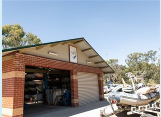
Image description: Red brick structure (boat shed), with open roller door.

The club is not-for-profit. It was established in 1990. It is dedicated to offering an inclusive sailing experience. The Sailability program has also produced accomplished sailors. It has achieved success at the Paralympic and international levels. It originated from a broader vision of disability groups.