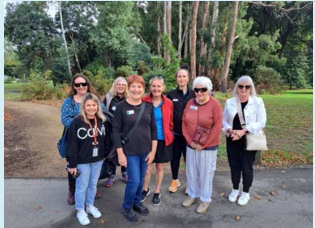
Image description: Eight women in a bush setting, smiling at camera.