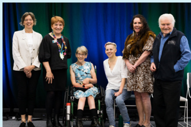
Image description: Six people facing camera and smiling at event. Two standing either side of two seated.