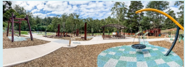
Image description: Belgrave Lake playground with soft-fall flooring and inclusive play elements.

Every new play space includes at least one piece of age- and ability-friendly equipment. Features include: Accessible paths and water fountains; Soft-fall flooring and wheelchair-accessible equipment; accessible ramps and picnic tables.