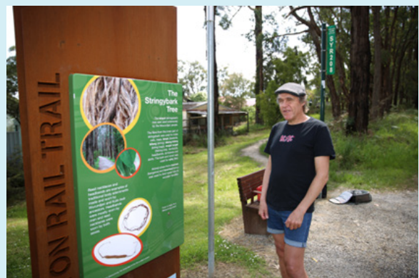
Image description: Community member standing to the right of signage on Warburton Rail Trail.