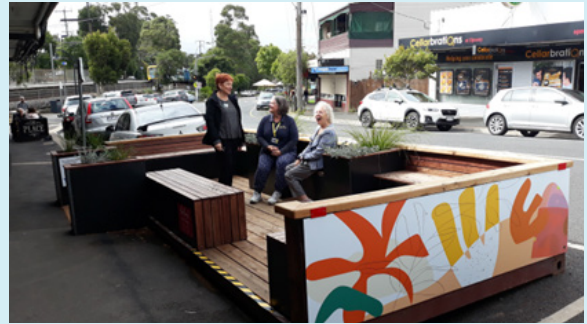
Image description: Three women talking at Upwey parklet. One is standing, two are seated. Entrance to accessible ramp on the left of image.

COVID-19 presented many challenges. Council wanted to support safe outdoor gatherings. Parklets were installed throughout the Shire. This was to encourage outdoor dining and community interaction. They had accessible features. This included space for wheelchair movement, ramps, varied seat heights, and shade. Advice from a DAC member and Vision Australia helped with features for those with visual impairment.