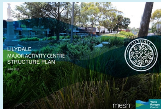
Image description: Lilydale Major Activity Structure Plan document cover: Features a retail precinct with plants in front, accompanied by sheer waves of colour spanning the entire image.

During the development of the Lilydale Major Activity Structure Plan, a focus group took part. It included individuals with disabilities, advocates, and support services. They engaged in extensive community consultation. Their insights informed the Structure Plan. It now includes key directions. They enhance disability inclusion, equity, and accessibility. This includes making public spaces easy to access as people use them for community interaction, learning and socialising.