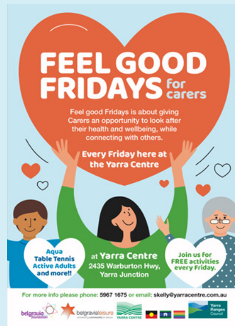
Image description: Flyer for Feel Good Fridays for Carers program. Three cartoon people smiling, coupled with text detailing the program.