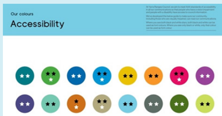
Image description: Accessibility page from Yarra Ranges 'Our Brand', guidelines document. Image shows coloured dots with black and/or white stars to indicate accessible colour contrast for each colour.

'Our Brand' is an internal document. It helps staff create documents in a consistent way, including accessible colour contrast and font size.