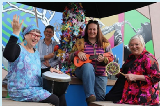
Image description: A group of four women seated, smiling at camera, each with a musical instrument in hand.

Community Keys: Draws from Luke Jerram's 'Play Me, I'm Yours' Street Piano artwork. It aims to bring music to the Yarra Ranges streets. Eddie and Mandy at ABC Piano Removals donated the pianos. Six will be placed in public locations from February to April 2024. Community members are invited to play and enjoy the pianos. They are all accessible via ramps or at street level. They have safety features to protect young children.