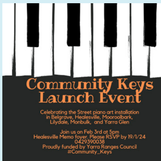
Image description: Flyer for Community Keys launch event. Black and white piano keys are positioned at the top. Text in orange is positioned from the mid-way point downwards.