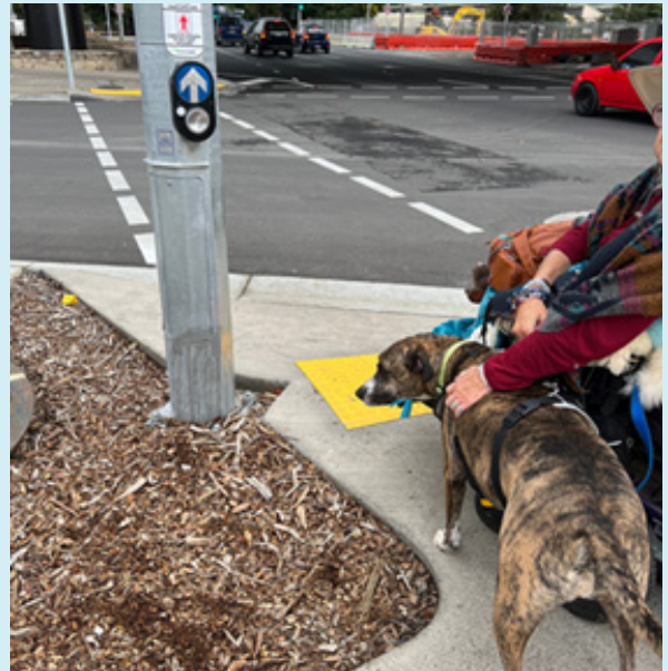
Image description: A curved footpath met by tan bark next to a road crossing button. A person in a wheelchair with a dog are on the right of the curve.

The audit also found many safety risks and accessibility issues. One concerns a curved concrete footpath near the pedestrian crossover at Main Street. It hinders wheelchair access to the pedestrian cross-over button that leads to the station entrance. Council resolved this issue by removing the curved feature. This made the station safer and more accessible for the community.