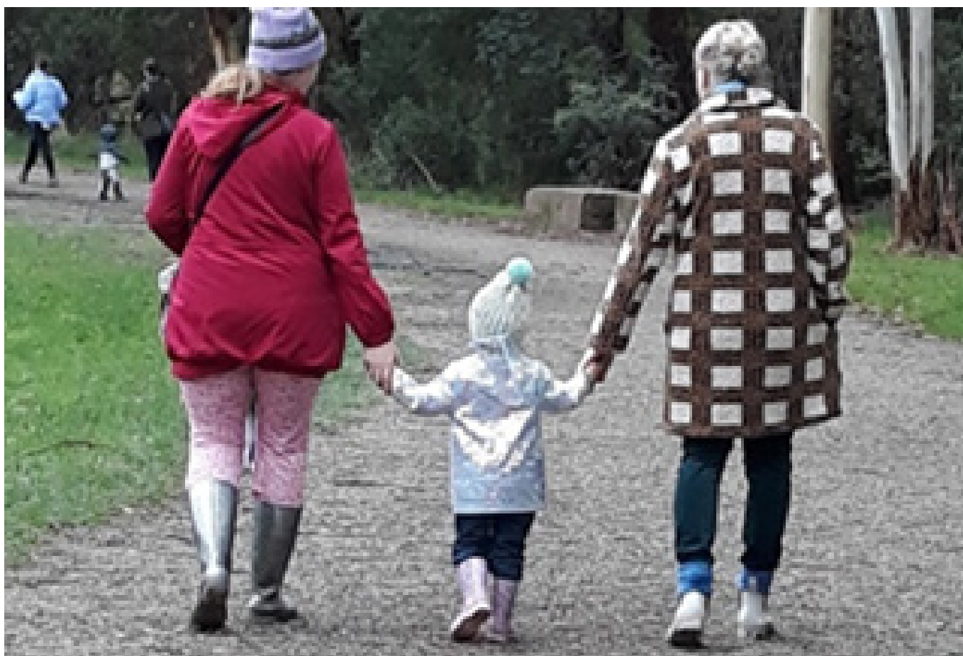
Image description: The back view of two adults (left and right) hold the hand of a child (middle), walking on a path in a bush setting.