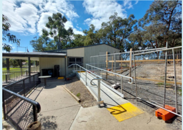
Image description: A new external ramp alongside construction fencing at Narre Warren East Pavilion.

The design and construction includes accessible parking, and compliant paths. There is an accessible toilet with a shower and baby change station. The community rooms include ambulant toilets, Braille signage, colour contrast, and tactile indicators.