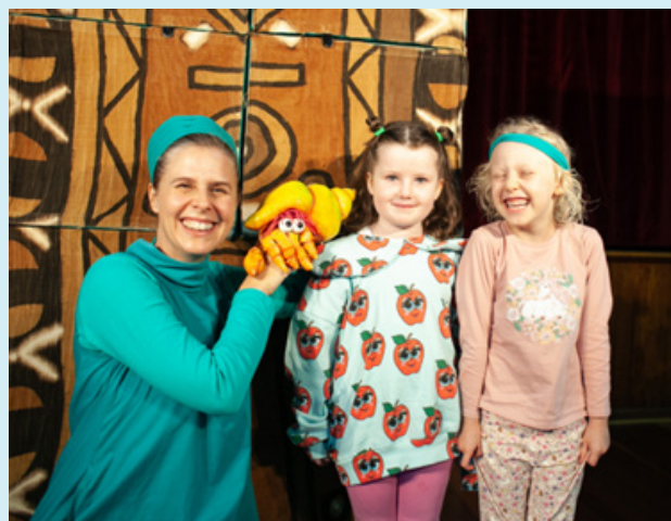
Image description: Woman (left) dressed in green with a toy crab on her hand, smiles next to two young girls (right) who are smiling, facing forwards.