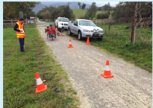
Image description: Man in a red jacket and blue jeans seated on a recumbent bicycle. Council officer is in high-visible jacket watching man manoeuvre around witches' hats on a section of the Warburton trail.

More collaboration followed. Council evaluated Adaptive Mountain Bike tracks near Lilydale Lake and also looked at the Wesburn and Warburton Mountains. Council checked if they are compatible with a recumbent bicycle and evaluated parking and toilet accessibility.